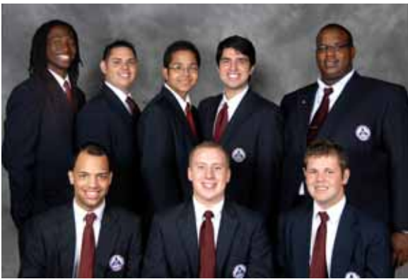
2008-09 National HOSA Executive Council

HOSA has promoted career opportunities in the health professions for 32 years! As a HOSA Partner at the 2009 National Leadership Conference, opportunities will be provided to network with 5,500 future health care leaders who will experience four (4) days of national competition, leadership development, team-building, health industry sponsored and conducted workshops, dynamic general sessions and high expectations!